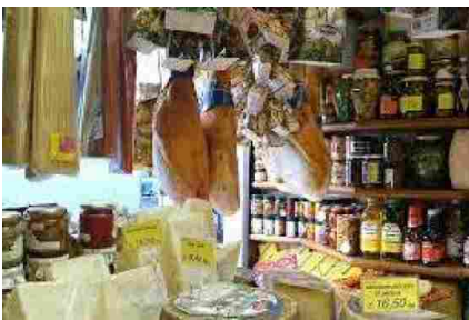
JUL 15, 2014 6334 - 0 'Fuggedaboudit' the motto of new Italian del...