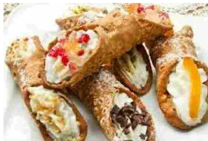
APR 29, 2014 5688 - 0 1st Annual Little Italy Cannoli Tournament